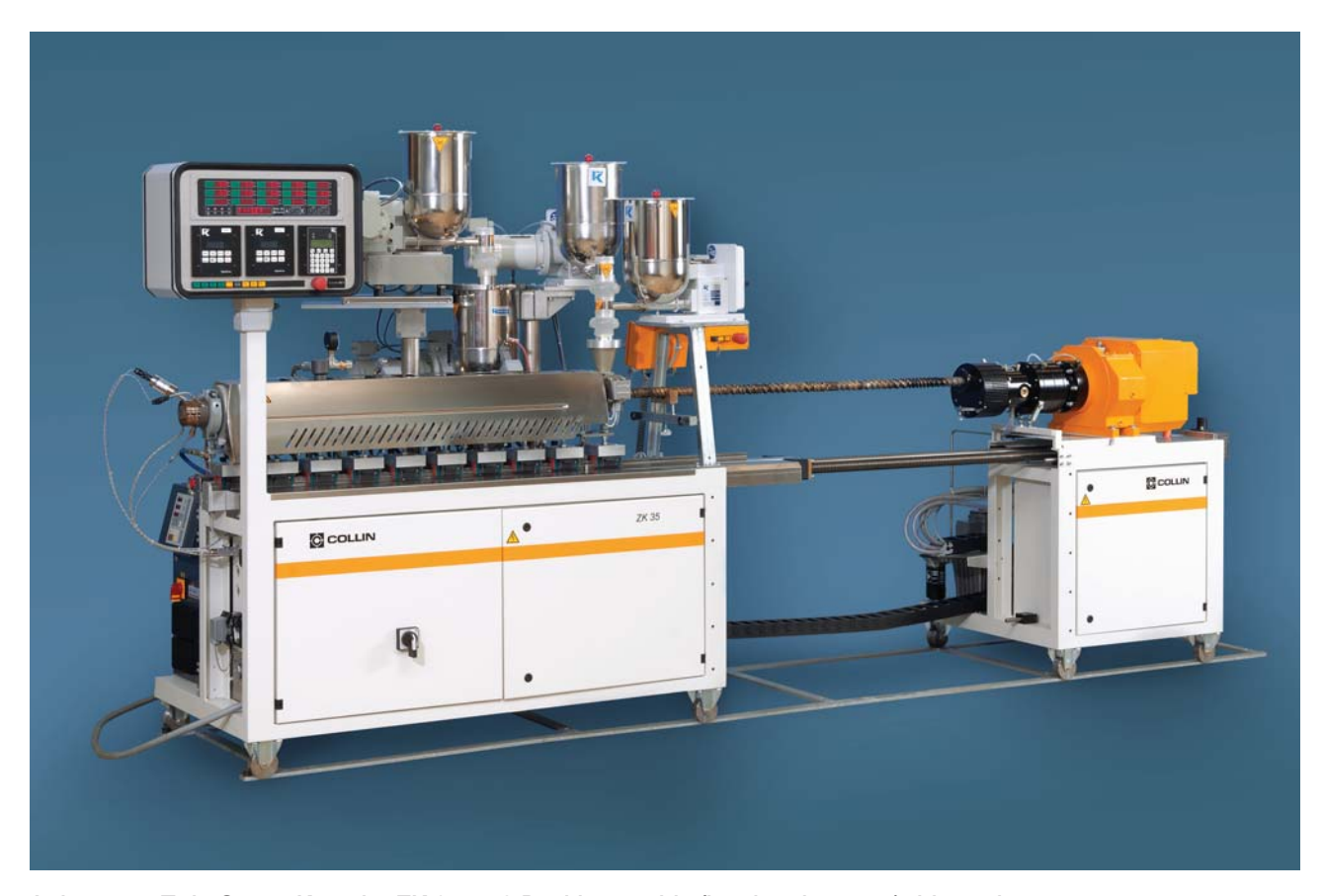
Laboratory Twin-Screw Kneader ZK 35 x 40 D with movable (by electric motor) drive unit