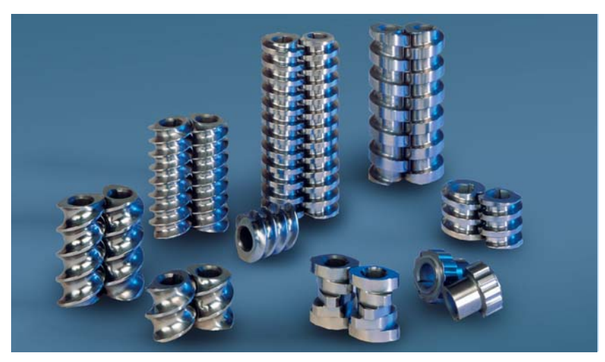
Selection of ZK 25 screw elements for co- and counter-rotating

The screw kits include a large number of single elements with various pitches and designs. These can take the form of close-comb or open profiles, single and double-start thread mixing and shearing elements for the counterrotating mode and close profiles for co-rotating screws.