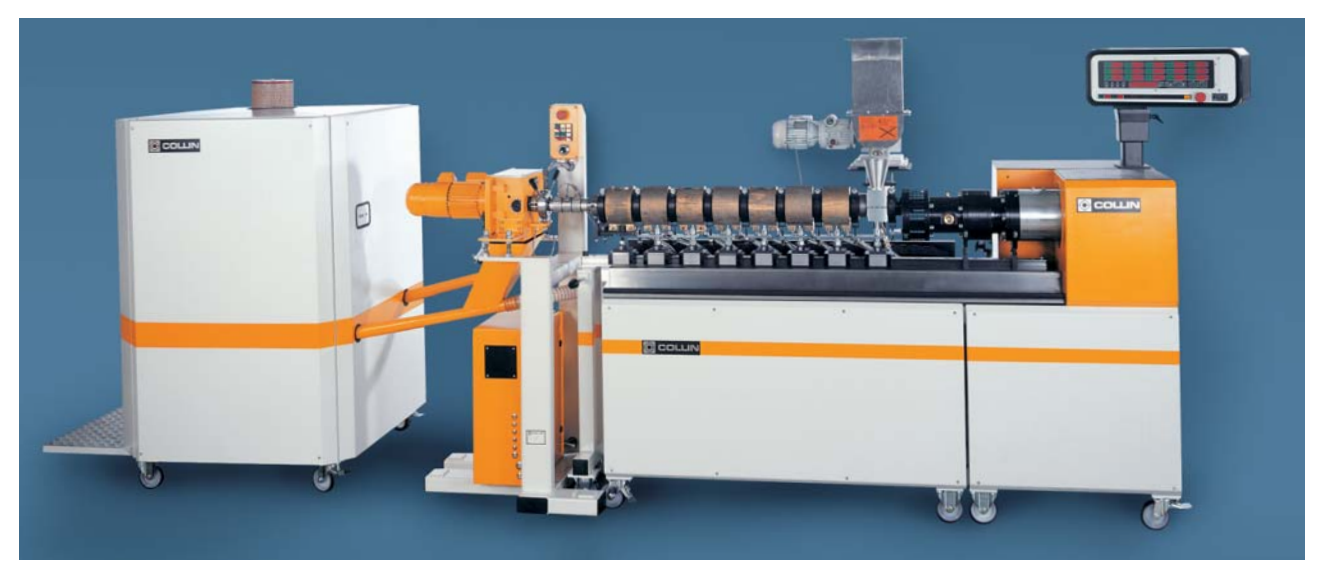
Twin-Screw Kneader ZK 35 x 32 D with top die face pelletizer and air cooling with cyclone