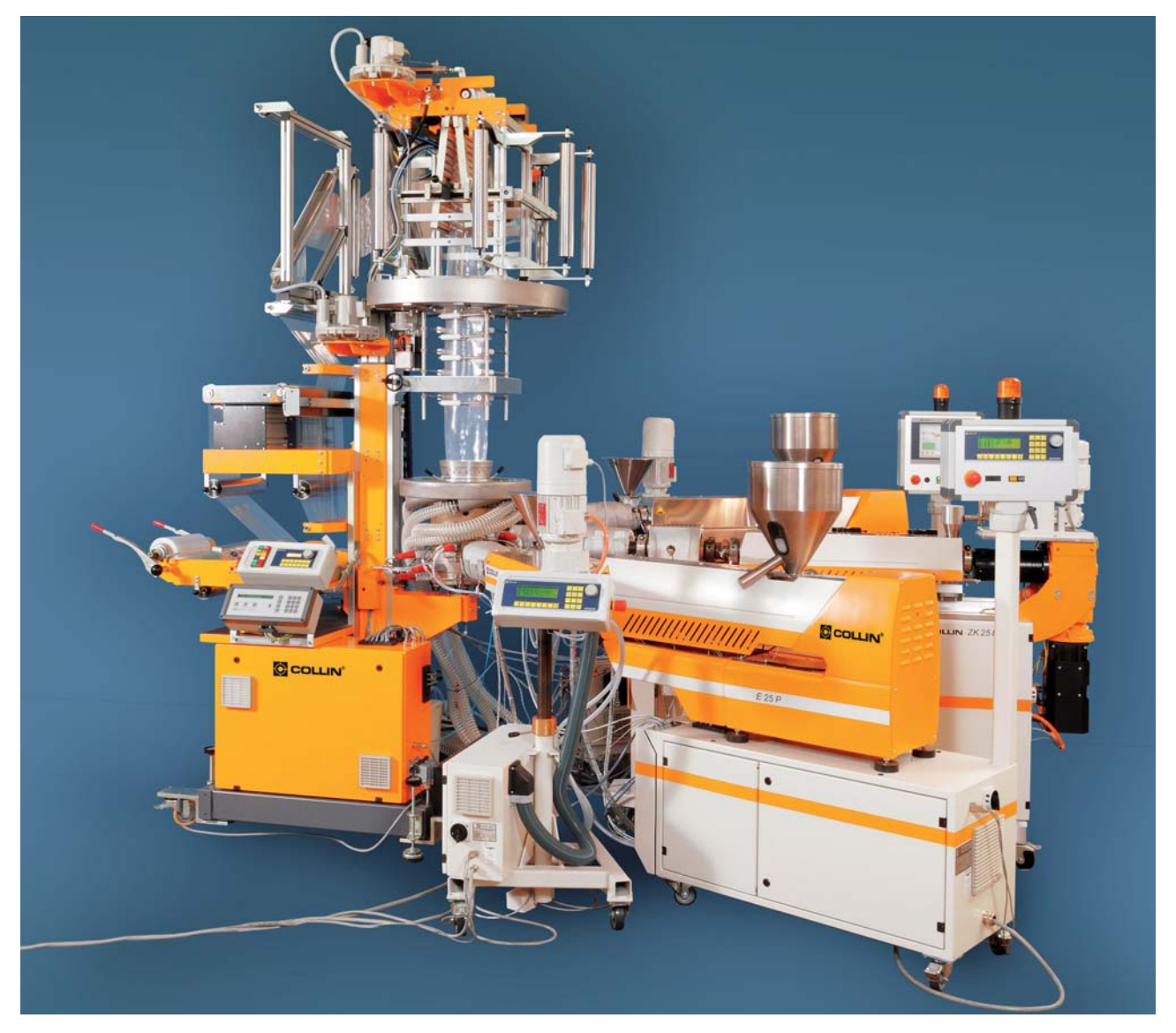
5 Layer coextrusion blown film line with direct extrusion of the central layer