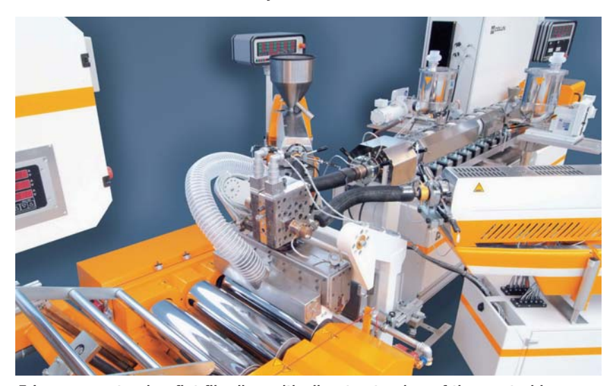
5 Layer coextrusion flat film line with direct extrusion of the central layer