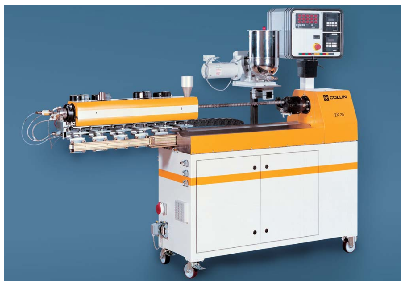
Laboratory Twin-Screw Kneader ZK 25 x36 D with 6 barrel elements in the opened position

All the signals can be transmitted via a serial interface and software to a separate PC.