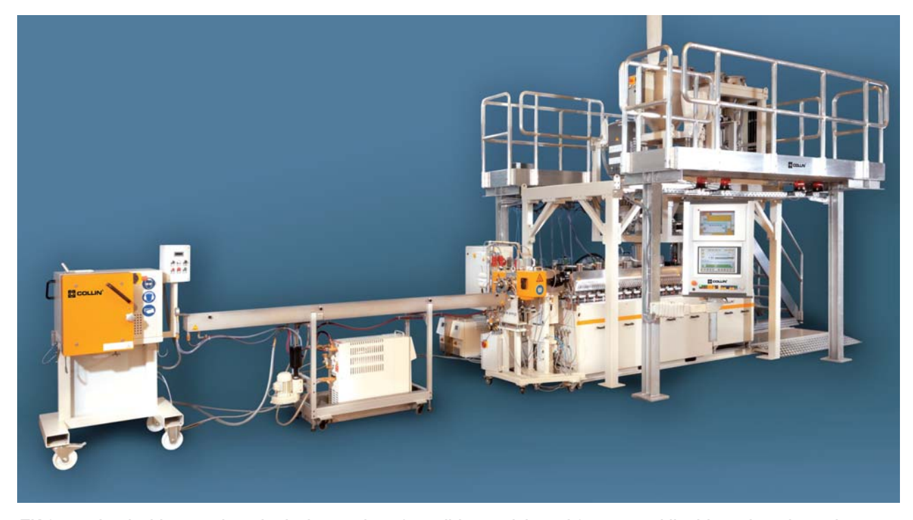
ZK 35 equiped with 4 gravimetric dosing stations for solid materials and 3 tempered liquid gravimetric stations