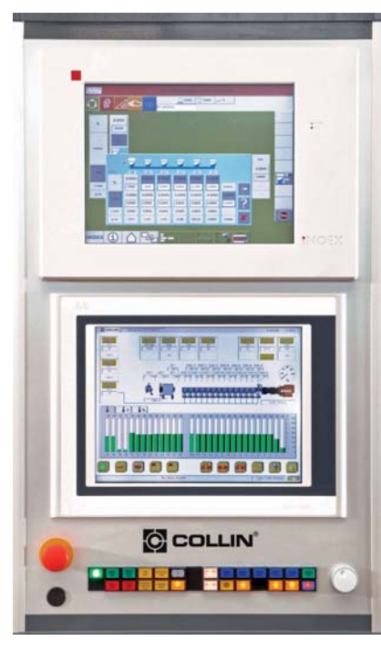
Completly integrated control system