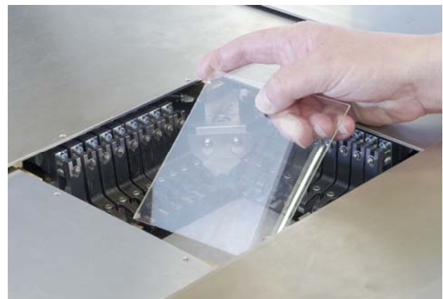
Clips and table ready for deposition of the sample

Two separate A.C. Servo drives are designed for the MD and TD direction. Each stretching direction can have its own acceleration, speed and stretching ratio. Automatic force control protects the mechanism against unforeseen overloads.