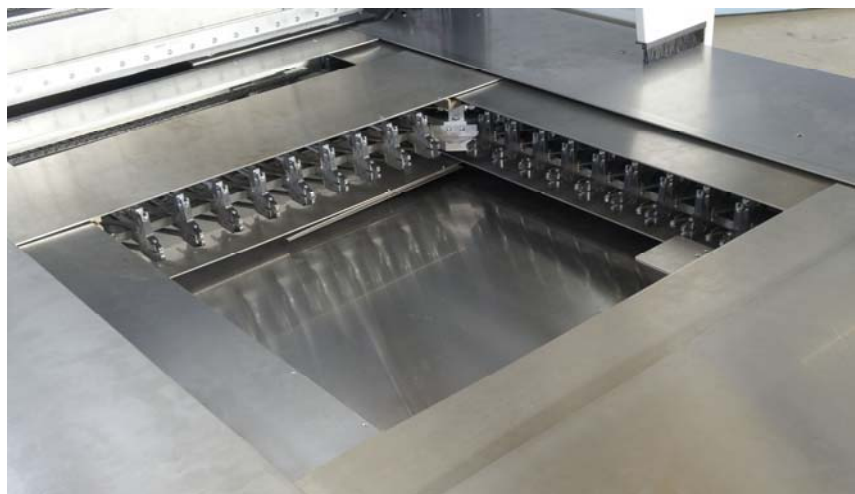
Clips and table ready for take out the stretched sample